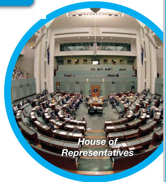
House of Representatives

A special Constitutional Convention was held in February 1998 to consider whether or not Australia should become a Republic and have an elected head of State rather than the Queen. The referendum, held in November 1999, rejected the Republic Model.