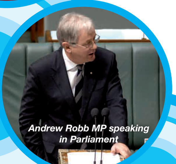
Andrew Robb MP speaking in Parliament