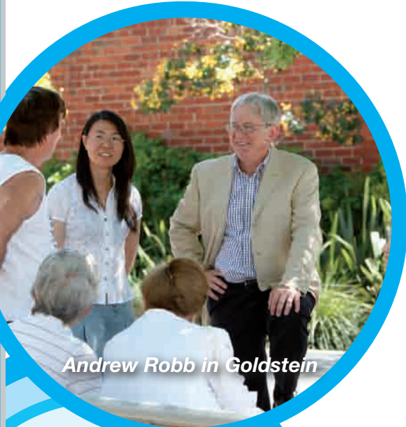
Andrew Robb in Goldstein

Andrew Robb is also Shadow Minister for Finance, Deregulation and Debt Reduction.